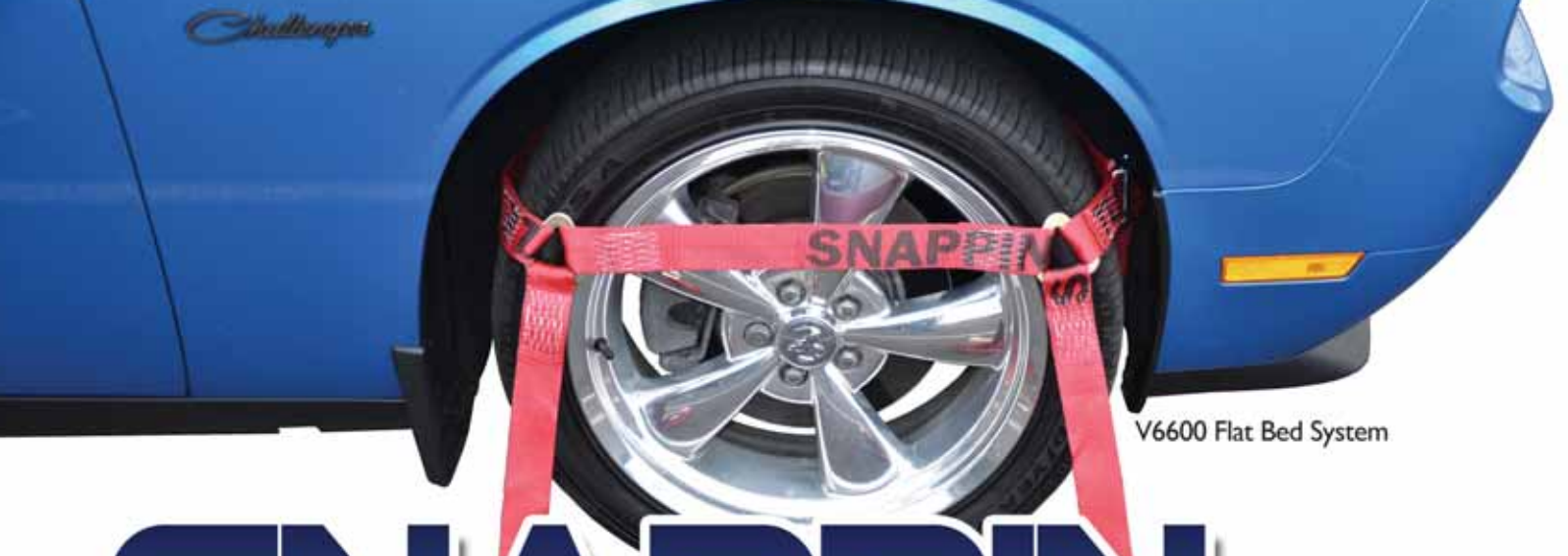
V6600 Flat Bed System