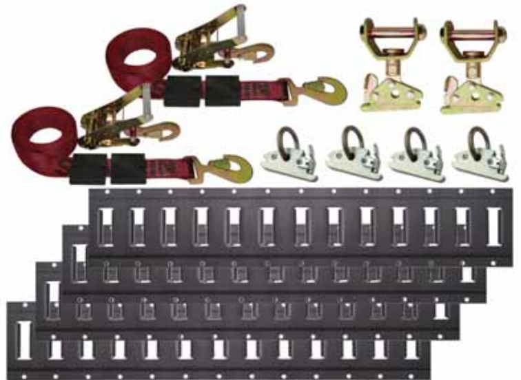
V6400 Low Clearance System

No one likes to lie on their back and crawl under the car to tie